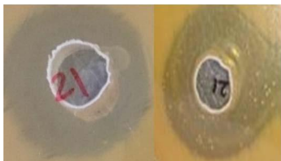
Fig. 2. Antibacterial activity of neutralized supernatant fluid of L. casei TA0021 against S. flexneri observed by agar well diffusion assay

which indicates the absence of glycol-lipid moiety in the protein bacteriocin molecule. The protein antagonistic compound was named Lactocin TA0021 hence forward.