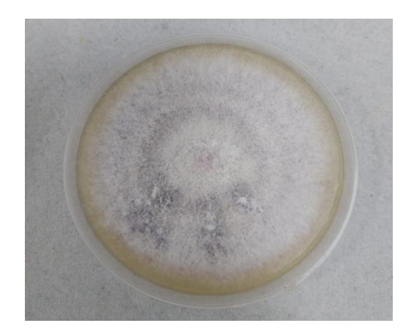
Fig. 1. Culture on Sabouraud's dextrose agar showing white to purple colonies of Fusarium spp.