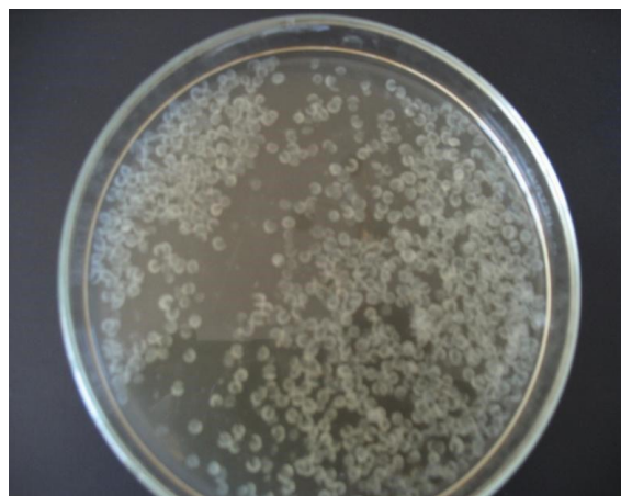
Fig. 2. Beads disrupted in BB medium at 37°C after 150 min.

leakage. The physical strength of beads was found to follow the order of PLL-coated > Chitosan-coated > non-coated, not differing for CP-loaded and CP-free beads.