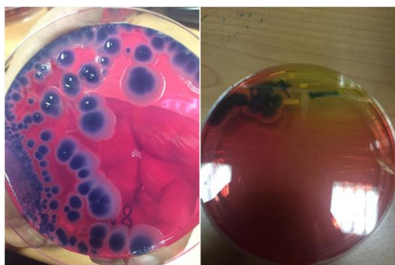
Fig. 3. HiCrome™ Bacillus Agar showing Blue large flat colonies with blue center of Bacillus cereus (Left) and yellowish green colonies of Bacillus subtilis (Right).

non-diseased truly excluded by the test (TN) among total non-diseased cases (TN+FP).