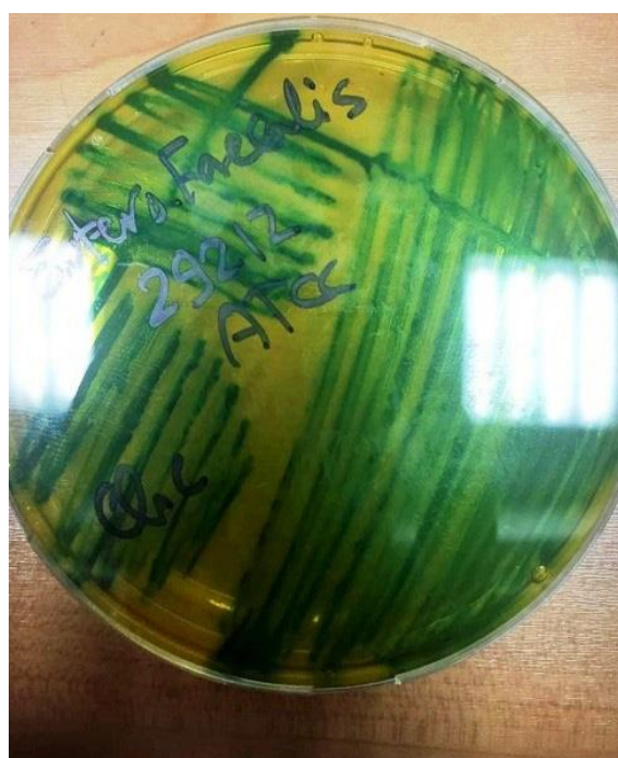
Fig. 4. HiCrome™ Bacillus Agar showing green colonies of Enterococcus faecalis ATCC 29212

d. The predictive value for a negative test: It is the percentage of cases truly negative among total negative cases.