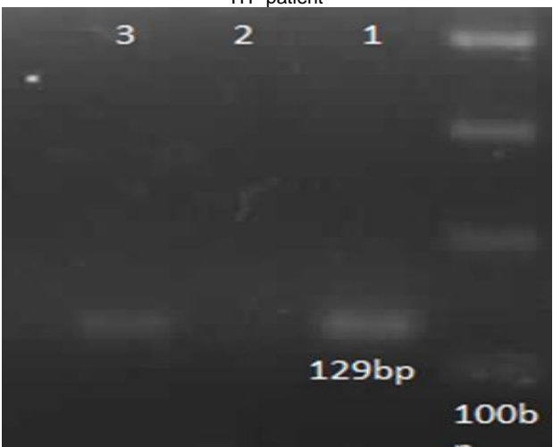
Figure 2: PCR analysis of EBV DNA samples extracted from ITP