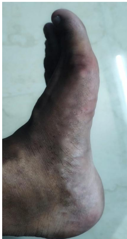
Figure 2. Recovery after treatment

Pemphigoid was 1st described by Lever in 1953, which is a disease characterized by bullous formation due to sub-epidermal detachment (5). There can be differential diagnoses of pemphigus foliaceus, pemphigus herpetiformis, linear IgA bullous dermatosis, eczema, urticaria, and prurigo. The diagnosis of BP was confirmed by Direct immunofluorescence and histopathology confirmed a definitive diagnosis of BP (5). In our case, the oral re-challenge test with vildagliptin was not done on ethical grounds. Causality assessment was done by both Naranjo and WHO-UMC scale and it was found to be a “probable” category in both. According to Vigiacess, a total of 740 cases of vildagliptin-associated bullous pemphigoid have been reported to date. The patient was treated with antihistamines, steroids, and conservative management.