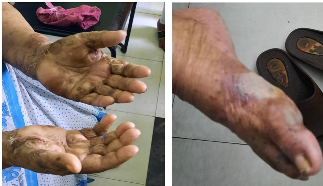
Figure 1. Pruriginous tense bullous skin lesion over both palms and over sole

a diagnosis of bullous pemphigoid was confirmed by the Department of Dermatology, R. G. Kar Medical College and Hospital. The patient was advised to immediately stop Vildagliptin. She was prescribed Tab Levocetirizine-5mg and Tab Prednisolone-