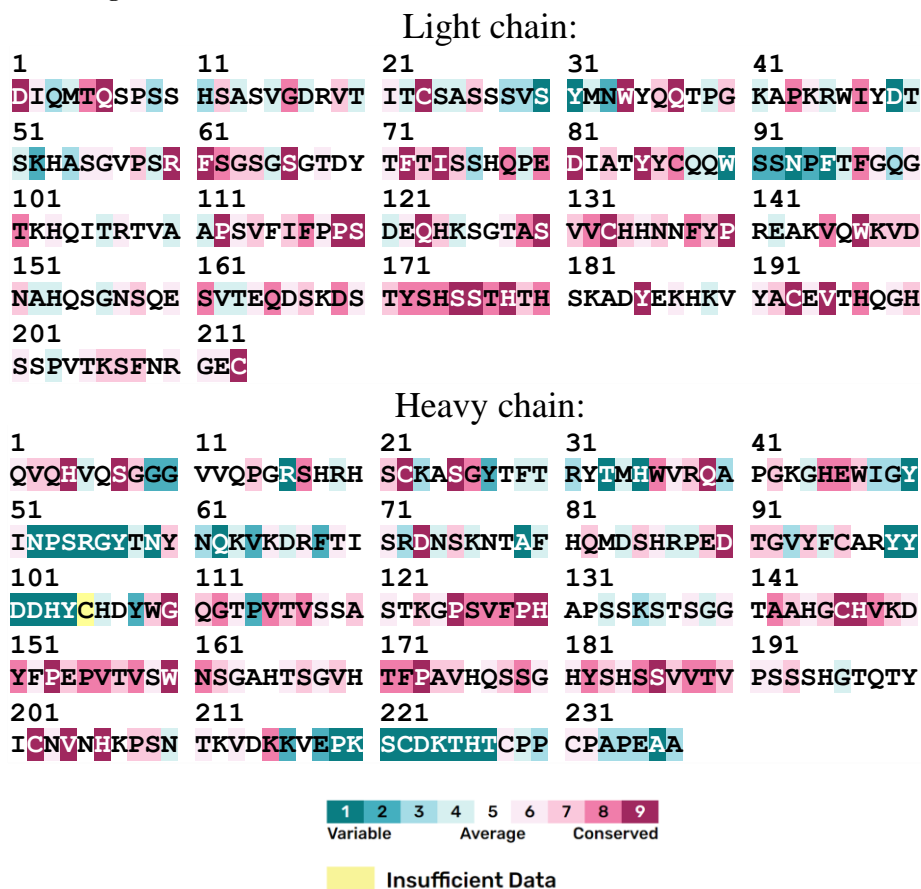
Figure 3. Ranibizumab conservation of amino acid positions evolution by Consurf server. The nine-color conservation scores are projected onto the 3D structure of the antibody and the colored protein structure is shown by FirstGlance in Jmol.