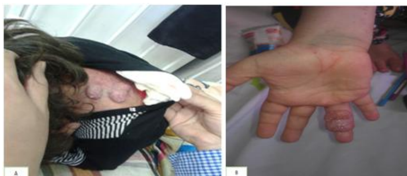
Figure 1. Wart-like skin lesion on the back of neck (A) and finger (B) of a 9-year-old girl with hyper IgE syndrome

Laboratory findings showed normal flow cytometry and, an evaluation of IgE to 11000 (IU/mL). Skin biopsy revealed angiolymphoid hyperplasia with eosinophilia in fingers and pseudoepitheliomatous hyperplasia in the neck lesions. The lesions' pus and exudate culture showed Staphylococcus aureus , which was sensitive to vancomycin and clindamycin. The result of the PCR test was positive for HSV viral load but negative for HPV. Chest x-ray revealed hyperaeration without the evidence of pneumatocele and pneumonia.