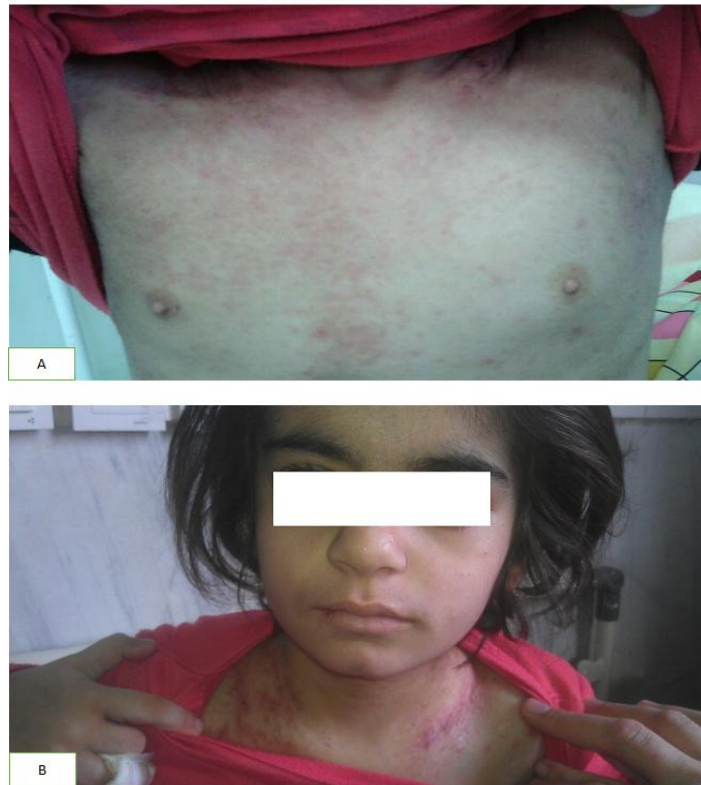
Figure 2. Eczematous lesions (A, B) in a 9-year-old girl with hyper IgE syndrome