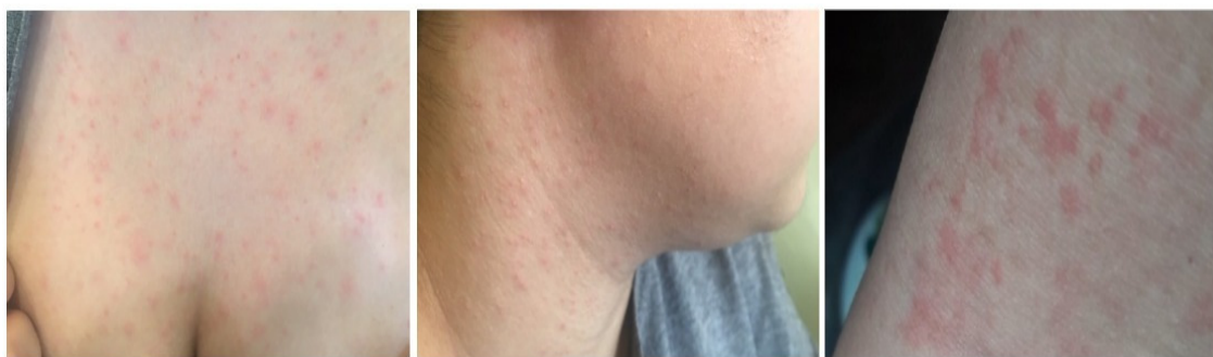
Figure 1. Maculopapular rash on the chest, neck, and hand of the patient

Skin prick tests (SPT) with basic food allergens and aeroallergens were performed after the complete dissolution of the symptoms. The allergens for testing were chosen based on the anamnesis. Standard industrial water-saline extracts of dust, dust mite, cat hair, sheep hair, feather, egg, chicken, beef, and fish (DiaterLaboratorio, Spain); mix-allergens of grass pollen, weeds pollen, and tree pollen (Biomed after I.Mechnikov, Russia) and the prick-to-prick technique with fresh vegetables, nuts, and kiwi as well as with corn and wheat powder were used. 11 Positive results were obtained with weeds pollen, grass pollen, egg, fish, corn, wheat powder, tree nut, peanut by the measure of \geq 3 mm in comparison with negative control (Figure 2).