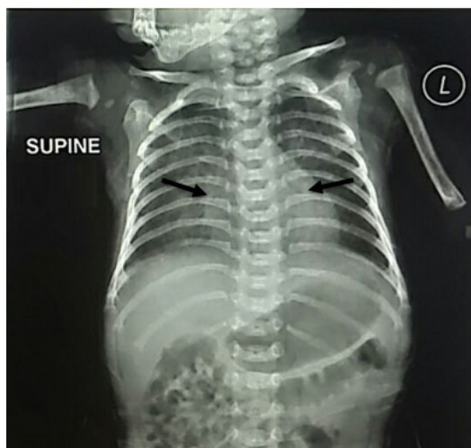
Figure 2. The chest x-ray of the proband (V-4) at 3 months of age indicated the miliary pattern in both lung fields. The arrows indicate the position of hila and lung congestion.