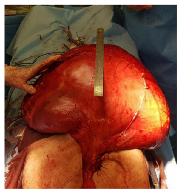
Figure 3 Giant megacolon with palpable fecal masses after laparotomy. A 50-cm sterile ruler is placed on the colon for comparison