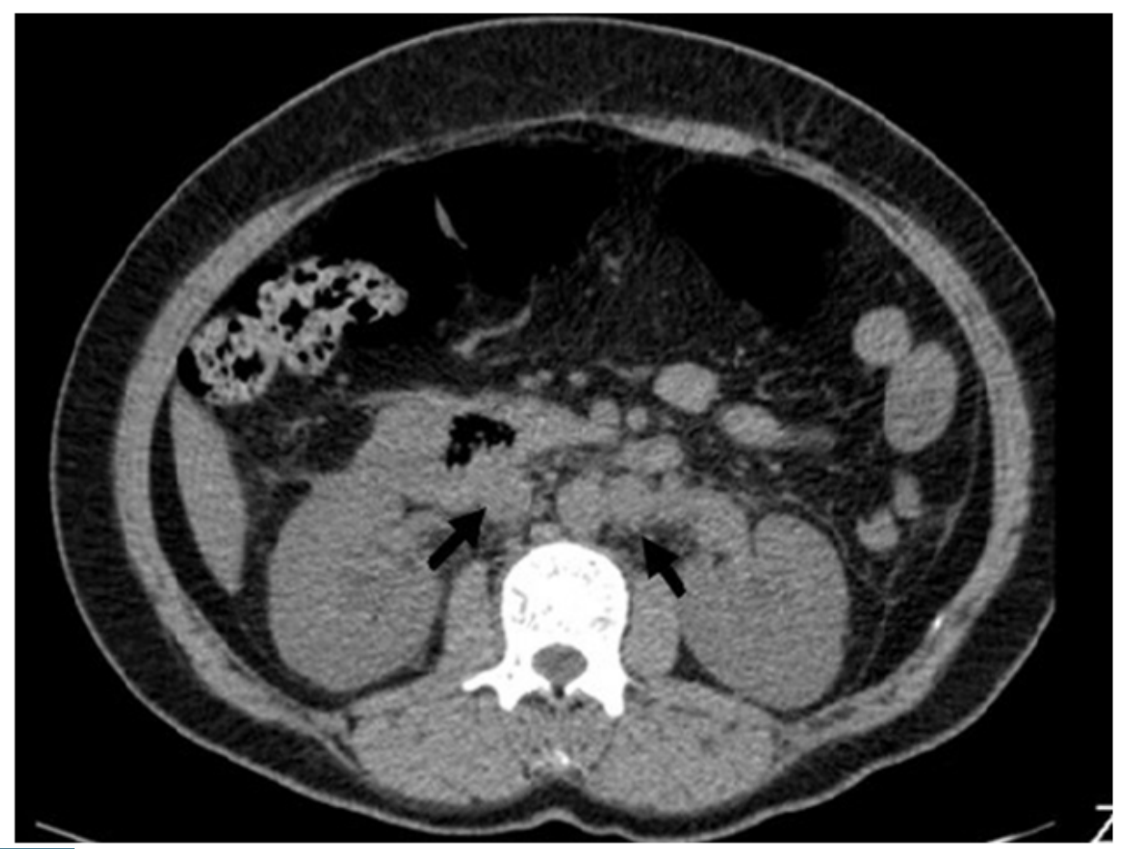
Figure 3 Abdominal CT without contrast showing dual IVC with two closed black arrows

the patient was hydrated with intravenous crystalloid. Upper endoscopy was performed, which was normal. Further evaluation was done, which showed elevated anti-cardiolipin immunoglobulin M (IgM) and immunoglobulin g (IgG). Her creatinine level decreased to 1.3 mg/ml over three days, and she was discharged by substituting warfarin with rivaroxaban.