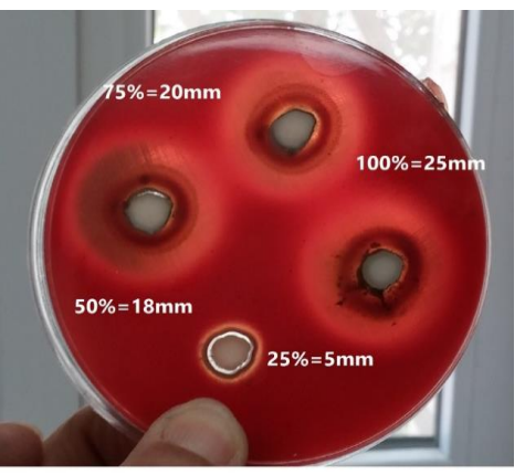
Figure 1. Inhibition zones increased by polyherbal toothpaste against Streptococcus mutans on blood agar at four different dilutions

<sup>a</sup>Values including the diameter of the well (7 mm) are means of three replicates.