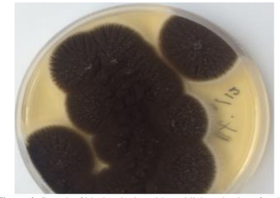
Figure 4. Growth of black colonies with conidial production after 48 hour's subculture onto potato dextrose agar

Within this lesion, a radiopacity of 2.1 \times 3.4 \times 2.3 mm that was irregularly shaped and was more radiopaque than bone was observed. Mucosal thickening is observed in the right maxillary sinus as far as it is included more peripherally in the image (Figure 5). This described appearance is consistent with the characteristic of FB due to Aspergilla species [10]. The patient was referred to an otolaryngologist for systemic involvement investigation. Blood tests and chest X-ray were requested, and the final results revealed no systemic spread as well as no other chronic disease in the medical history of the patient. The patient, who was diagnosed with Aspergillus niger, was brought to the general operating room following routine pre-operative preparations. He was placed under general anesthesia with a nasal tube. A tampon for the throat was placed, and the mouth was irrigated with povidone-iodine solution (BATTICON<sup>®</sup>, 10%; Adeka, Samsun, Turkey) + Saline serum solution. For intraoperative hemostasis and postoperative analgesia, regional and infiltrative anesthesia with a total of 6 cc adrenaline-containing local anesthesia was carried out for the right side of the maxilla, which is the operating area of the patient.