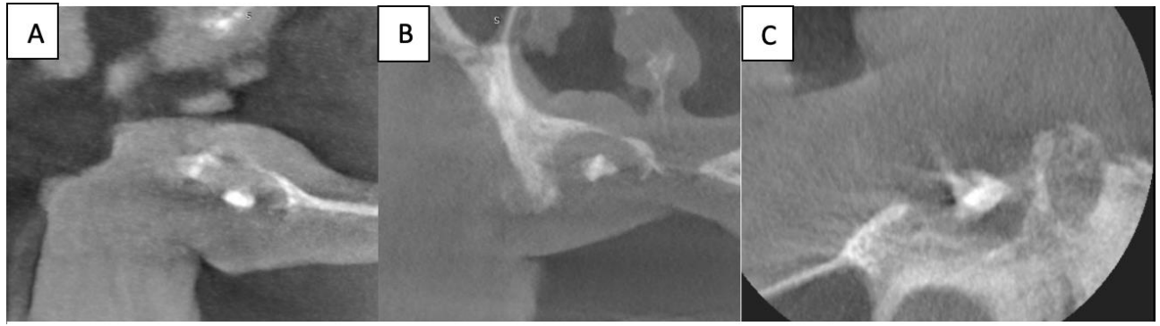
Figure 6. Sagittal (A), coronal (B) and axial (C) sections show a metallic radiopacity consistent with the surrounding fungus ball. Note that is there is a perforation at the floor of the nasal cavity and destruction at the buccal crest

amoxicillin oral tablets for prophylactic purposes. One week later, after the sutures were removed, he was referred for a total denture. Two months after, he started using her prostheses, and he was called for an observing session. He had no complaints, and his overall oral health improved. Moreover, the patient stated that his inhaling comfort was also enhanced. Pathological examination revealed the presence of aspergillosis-associated hyphae and eosinophilic body cysts in the active chronic inflammatory connective tissue. All these results are a strong confirmation of our diagnosis.