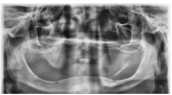
Figure 2. Orthopantogragh of the edentulous maxilla and mandible

Confirmation of the species level of the isolate that was identified with classical methods was confirmed with MALDI-TOF by İzmir Atatürk Training and Research Hospital, Medical Microbiology Laboratory, Medical Mycology Unit. After unexpected results of the microbiological examination, cone beam computed