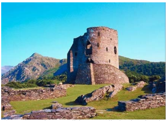
Figure 2. Ancient Gondishapur medical university, the most important medical center of the ancient world during the 6^{th} and 7^{th} centuries

By the introduction of Islam to Iran (651 AD), in the medieval period, there were significant improvements in hygiene observation methods.35 The Gondishapur medical center continued its activity until a few centuries later, training the first Muslim physician, Al-Harith ibn Kalada. However, after the conquest of Islam, the Zoroastrian healing methods (divine words) diminished and the destructed libraries of Gondishapur medical center was replaced with the Holy Koran.<sup>35</sup> After a few years, the medical center of the country was transferred to Baghdad, where the Greek, Iranian, and Indian scientists gathered to develop medicine based on the vast scientific works of outstanding Persian scientists (including Razi or Rhazes, Alpharabius, Jorjani, and Avicenna) to introduce their medical knowledge to the Islamic world.35