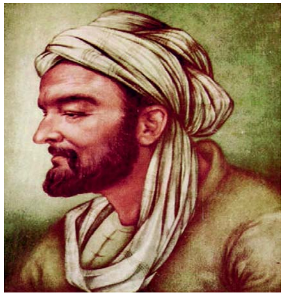
Figure 4. Ibn Sina (Avicenna) (980-1037 AD)

Finally, modern medicine started with the establishment of Dar al-Funun in 1851 for training physicians academically under the supervision of European and American teachers.43 This was the first time the fields of medicine was separated, and the primary rules of each specialty were mainly derived from the European medical schools; some scholars completed their medical education in European countries.43 Given said that, all the achievements of Iranian physicians and scientists were separated as traditional medicine and considered as a subsidiary field. University of Tehran, Tehran, Iran, was the first modern university in Iran which was established in 1934 and considered as the mother university in Iran (Figure 5).44 The School of Medicine of Tehran University was established in 1934 which is still the most well-known center of medical education in Iran.44