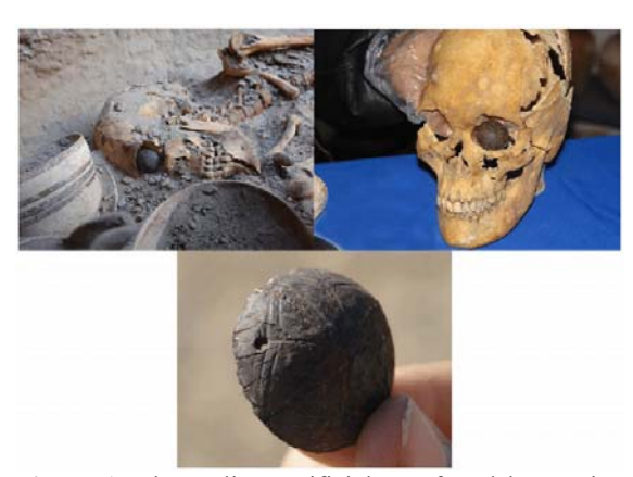
Figure 1. The earliest artificial eye found by Iranian archaeologists in Shahr-e-Sukhteh, Iran

13-year-old girl with congenital hydrocephalus, who underwent surgery for removing a part of her skull.<sup>32</sup> Based on the investigations, the patient lived for more than six months after the surgery.<sup>32</sup>