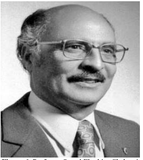
Figure 6. Professor Seyed Ebrahim Chehrazi, the father of modern neuropsychiatry in Iran

In 1929, Dr. Ebrahim Chehrazi (Figure 6),<sup>58</sup> "The father of modern neuropsychiatry in Iran", was chosen by the government for a scholarship to go to Paris to study medicine.