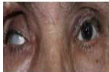
Figure 4. Blepharoptosis has been improved one-month post operation of aneurysm

Botulinum toxin has gained popularity in symptomatic management of patients with HFS despite the need for repeated injections and high costs. 3,4 This approach is generally safe, provides quick response and possible side effects including blepharoptosis that is usually mild and transient. Ptosis attributed to botulinum injection usually manifests within 2-3 days after the injection, peaks at about 7 days and gradually improves within weeks.