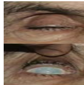
Figure 1. Left Blepharoptosis one week after botulinum toxin injection

botulinum toxin had been regularly injected for his symptom relief in orbicularis oculi, corrugator, and procerus muscles.