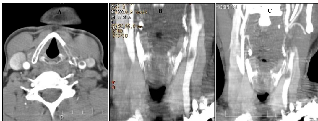
Figure 3. Computerized tomography angiogram (CTA) shows a free-floating thrombus (FFT) in left common carotid artery (CCA) attached to medial intima (donut sign) (A), mural attachment of clot (B), and mural attachment plus distal floating part of thrombus (finger sign) (C)

FFT is defined as an elongated thrombus attached to the arterial wall with circumferential blood flow at its distal most aspect with cyclical motion relating to cardiac cycles. Internal carotid artery (ICA) stands for the most prevalent site of thrombosis, 75 percent of all cases. CCA and carotid bifurcation are the next (7%). A wide range of incidence rate, 0.05 to 1.45 percent, has been reported so far with a male predominance and younger age group. 1 Several overlapping pathologies are implicated to be the cause of FFT including intraluminal thrombus, embolic thrombus, plaque thrombus, or mobile thrombus. It is said that atherosclerosis and hypercoagulate state are the leading etiologies of carotid thrombus formation. 1 But, as mentioned sparsely in literature, other reported causes are hyperfibrinogenemia, iron deficiency anemia and thrombocytosis, stimulant drugs, carotid aneurysms, arterial dissections, malignancy, paradoxical embolization through a patent foramen ovale (PFO), and meningioma. 2-5