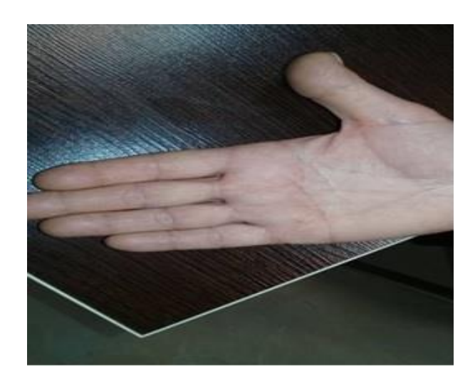
Figure 3. Atypical, limited scleroderma, palm region