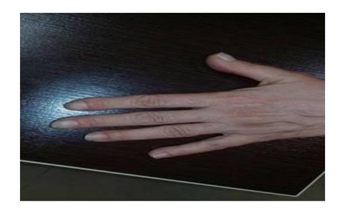
Figure 2. Atypical, limited scleroderma, dorsum the patient's hand