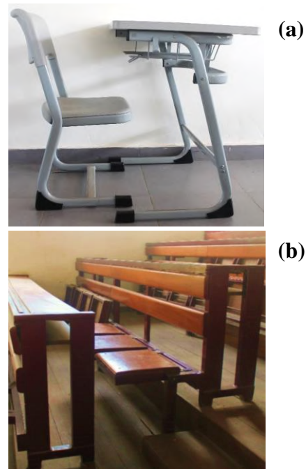
Figure 2. Side views of the (a) plastic (imported) and (b) wooden classroom furniture used by the students