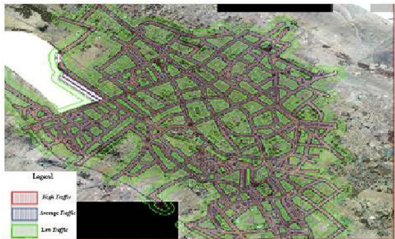
Figure. 1: Categorization of Yazd city into Three Areas with Low, Medium and High Traffic

To calculate the sample size, the minimum correlation coefficient ( r=0.35 ) between the sound sensitivity score and the aggression score, as well as the first ( \alpha=0.05 ) and second ( \beta=0.20 ) type errors were considered. 300 people were included in the study. Through stratified random sampling, authors included 100 people from each category (with low, medium and high traffic) in the study.