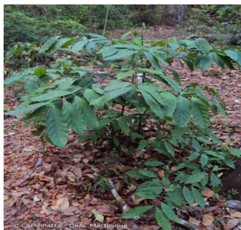
Figure 1. Funtumia elastica (Preuss) Stapf plant.

The leaves of F. elastica were collected from the