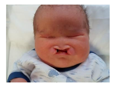
Figure 1. Clinical picture of the patient with arhinia, bilateral anophthalmia, and cleft lip and palate