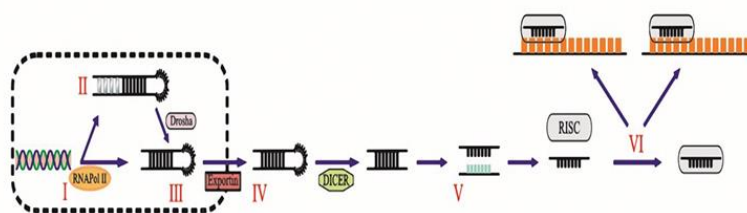
Figure 1. MicroRNA processing. RNA polymerase II and proper transcription factors excite the transcription of the microRNA gene (I) in the production of a pri-miRNA. The primary transcript (II) is then processed by an RNAase III enzyme called Drosha to produce a ~ 65 nucleotide (nt) pre-miRNA. The pre-miRNA, which has a short stem of 2–3 nt 3' overhangs (III), is then exported by exportin 5 (EXP5) to the cytoplasm for additional processing. In the cytoplasm, the precursor microRNA subsequently processed into a mature 19–24 nucleotide duplex (IV) by an enzyme called Dicer. Afterward, the duplex is separated into a primary and secondary strand (V); then, the primary strand is embedded into the RISC (RNA-induced silencing complex). In the next step, the microRNA with RISC targets complementary mRNA transcripts (VI) at the seed region to induce either block translation (right) or mRNA degradation (left)

to maintain cancer cell survival and drug resistance contribution (77). Besides, pro-apoptotic miRNAs serving as anti-cancer agents (78). The miRNAs also play a key role in the metabolism of cancer cells (79). They regulate nutrient uptake, targeting transporters, and metabolic enzymes and modulating cancer cell metabolism. They increase the accumulation of materials to control metabolic flux and support proliferation (80,81). We summarized some important onco-miRNAs and their functions in Table 1.