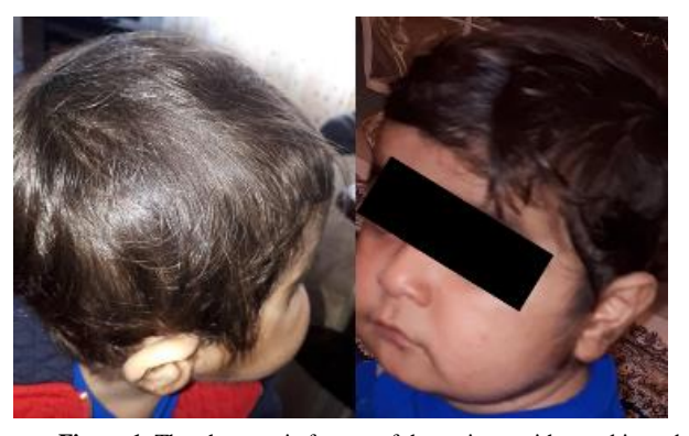
Figure 1. The phenotypic feature of the patients without skin and hair pigmentation under physical examination

An 8.5-month-old boy was brought to our hospital with complaints of fever, petechial purpura, and several times of vomiting. He developed productive cough and conjunctivitis a few days after the admission time. He was phenotypically normal (Figure 1). On physical examination, he had an ill appearance, and abdominal examination revealed huge splenomegaly and hepatomegaly (with a span of 10 cm) without any detected source of infection.