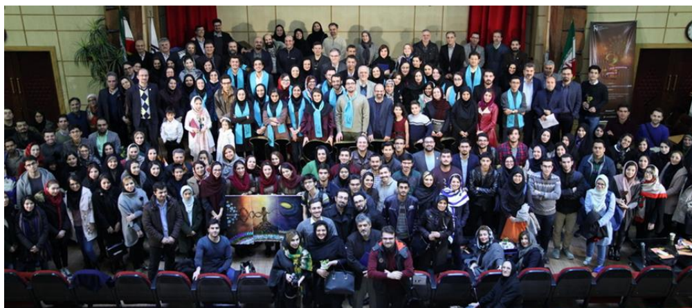
Figure 3. The group photo of 3 rd USERN Anniversary, Jan 1 st 2019, Avicenna Hall, Tehran University of Medical Sciences