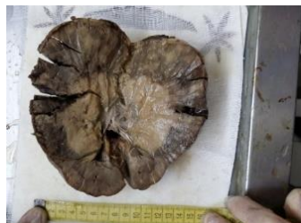
Figure 1. Gross appearance of tumor in the middle portion of kidney

Immunohistochemistry (IHC) results showed positivity for Cytokeratin (CK)8 (Figure 3) and Cluster of designation (CD)117 and negativity for Vimentin, CD10, CK7 and CK20. The patient discharged on 23 rd September with good condition and stable vital signs. Written informed consent was obtained from the patient. No further follow up was available for the pathologist.