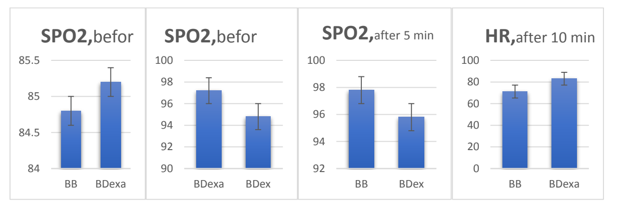
Figure 2- Comparative chart of some of the vital indicators of the patients under study with significant changes

between the BB and BDex (P=0.039) groups on the other hand, the HR factor also showed a significant difference between the BB and BDexa (P=0.043) groups at 10 minutes post-sedation (Figure 2).