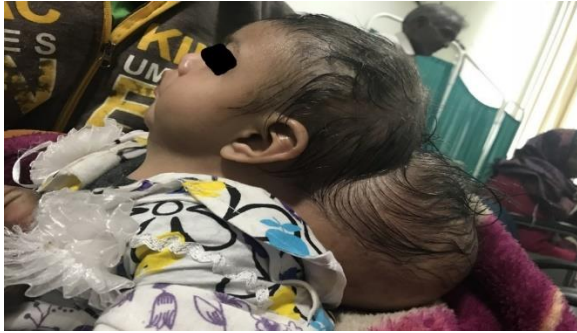
Figure 2- Occipital encephalocele involving posterior elements of the atlas, axis, 3rd and 4th cervical vertebrae.