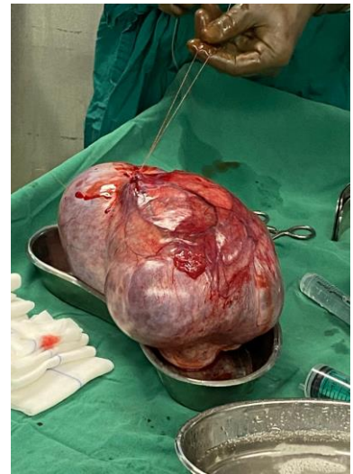
Figure 3- cyst of approximately 30 x 20 cm