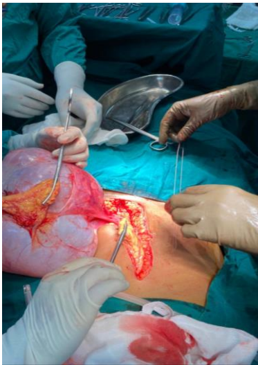
Figure 1- ovarian mucinous cyst

The patient was successfully reversed with Inj. Suggamadex 4 mg/kg and extubated in the operating room with stable respiratory and cardiovascular parameters.