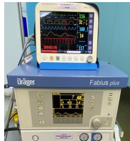
Figure 5- ventilator settings

Postoperative monitoring focused on early detection of complications such as pulmonary edema,