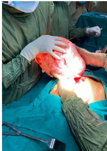
Figure 2- removal of cyst