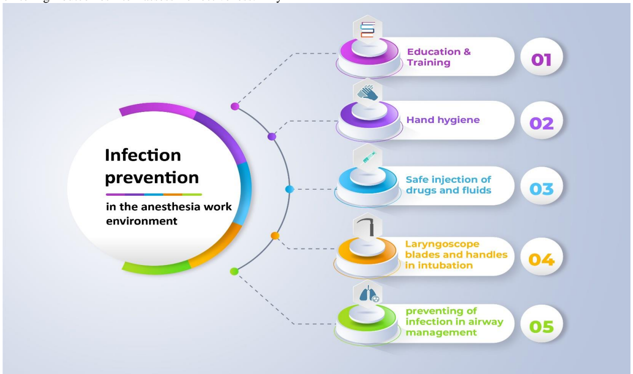
Figure 1- The most important effective factors of infection control in the anesthesia work environment

By exploring these additional dimensions, the discussion can provide a more comprehensive understanding of contamination in the anesthesia work environment and the multifaceted strategies required to mitigate risks and safeguard patient safety.