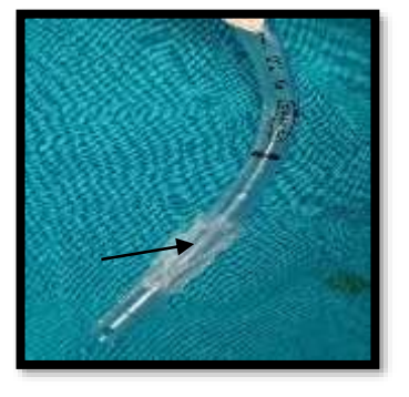
Figure 1- kinked endotracheal tube