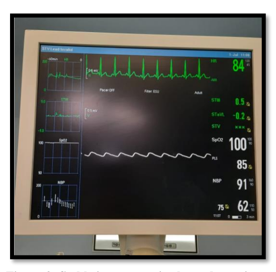
Figure 3- Stable intraoperative hemodynamics